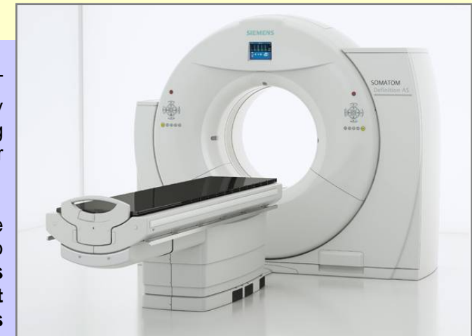
The new Somatom Definition AS 64 CT Scanner will be installed by February, 2014

During this time we want to continue to provide the best care possible without transporting or directing our patients to another facility so we will utilize a mobile CT van. This van is scheduled to arrive during the first week of November. It will be parked in front of the SSB in the parking stalls north of the breezeway between the SSB and the Admitting area.